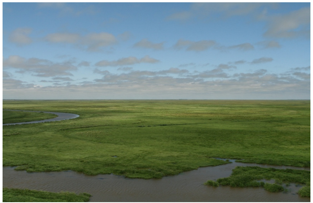
The natural wetland landscape at Yanwodao in Naoli He Nature Reserve (CN032), a remnant of the vast wetlands that used to cover this part of the Sanjiang floodplain before large scale development took place.