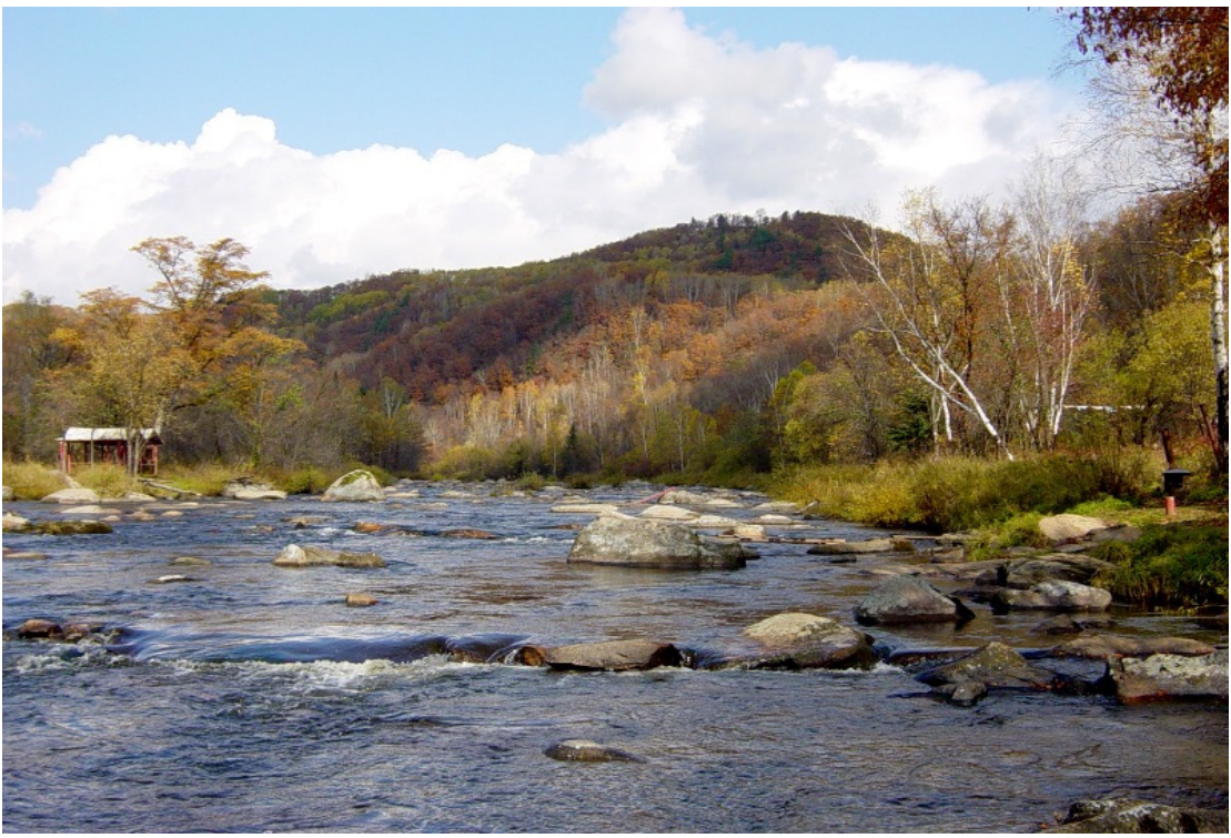
Liangshui Nature Reserve (CN020) is a breeding site of Scaly-sided Merganser Mergus squamatus .

IBA CODE: CN020 NAME: Liangshui Nature Reserve CRITERIA: A1 A3 AREA: 12,133 ha COORDINATES: 47°11'N 128°52'E ALTITUDE: 280-707 m